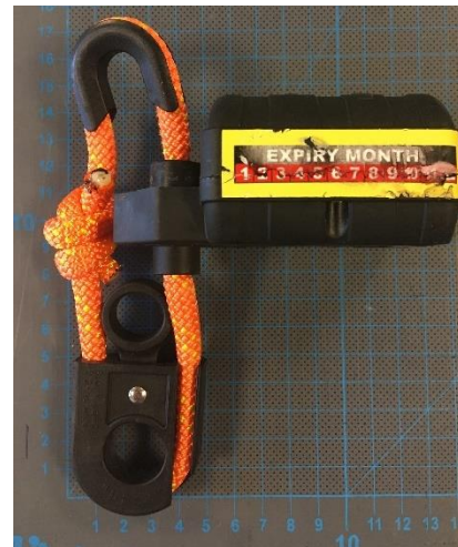
HRU 73595 opposite side