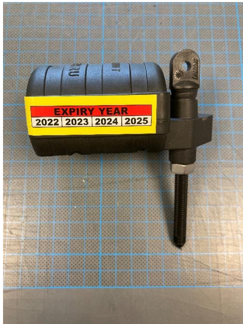
HRU 74579 for EPIRB with mounting kit 74580 one side

Photo of product variant 74579-LALIZAS Hydrostatic Release Unit for EPIRB used only with mounting kit 74580: