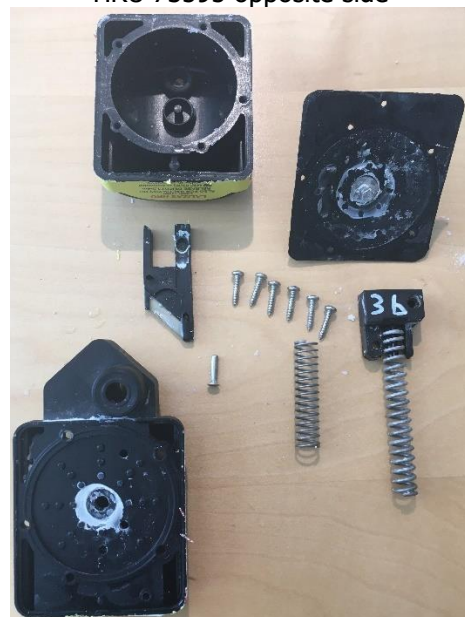
HRU 73595 inside