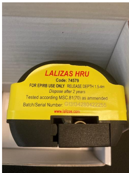
HRU 74579 for EPIRB marking