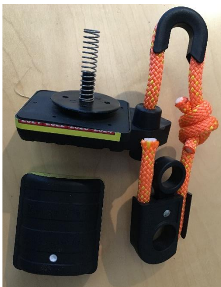
HRU 73595 inside