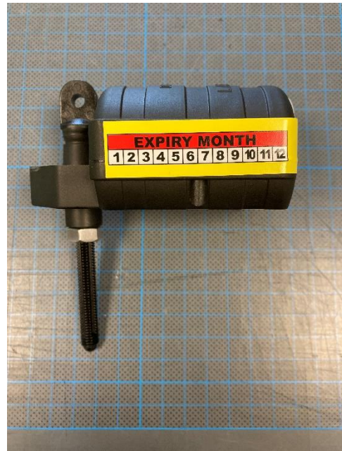
HRU 74579 for EPIRB with mounting kit 74580 opposite side