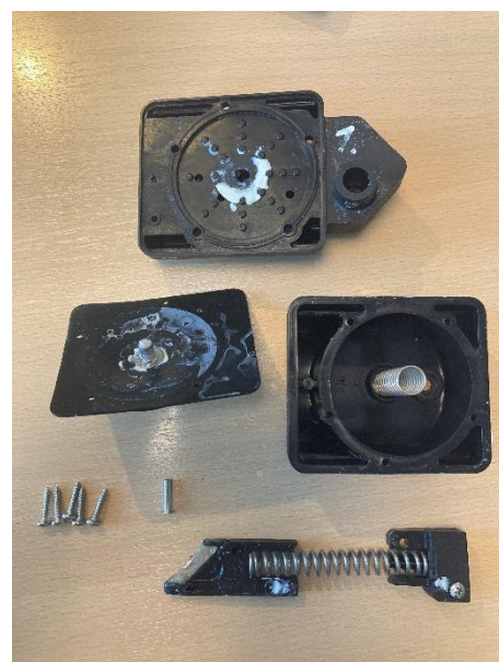
HRU 74579 for EPIRB inside